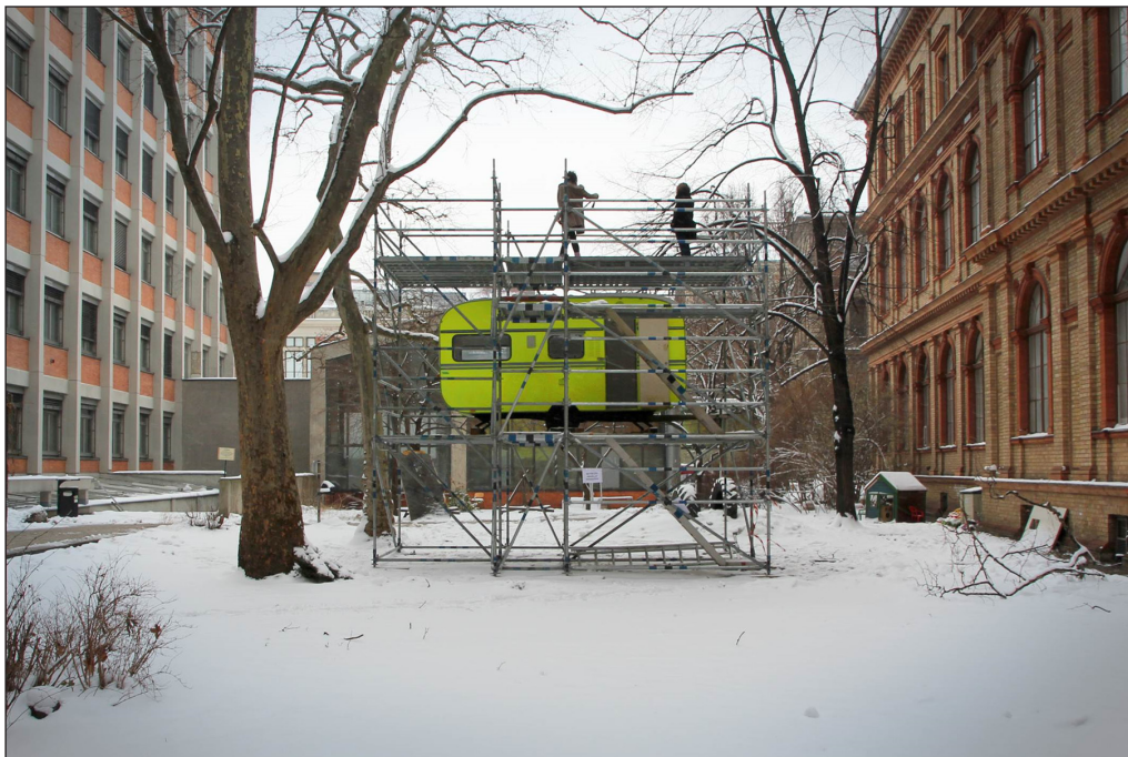
Rainer Oellinger, Conversation Series , 2013.

A long term inquiry into the perception of what is good art has been conducted by artists Hannah Rosa Oellinger and Manfred Rainer in Vienna. In their ongoing project, Oellinger and Rainer question the criteria by which young artists and art school graduates examine and judge contemporary art. Through a series of surveys, they conclude that artists choose to show things that have 'worked' for other artists. The Oellinger/Rainer research shows that young artists' choice of mediums, compositions, themes, materials, colours and gestures are based on what has already proven effective for other artists (either critically or commercially). Those are the ones accepted as "good art" within contemporary art and are therefore most likely to be repeated. For both Garrido and Oellinger/Rainer, it is not a specific image or a discernible material that testifies to a sociological or anthropological true nature of contemporary art, but rather the aggregated presence of things which testifies to an economical logic which underlines contemporary art.