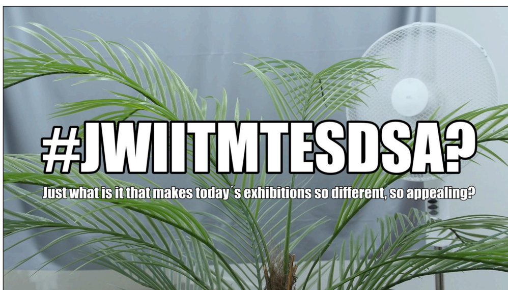
Cristina Garrido JWIIITMTESDSA Mixed Media Installation 2015.

Francesco Finizio's installation How I Went In & Out of Business for Seven Days and Seven Nights recounts the weeklong performance that took place in the ACDC Gallery in Bordeaux in October 2008. During a week right after the bankruptcy of Lehman Brothers investment bank, Finizio invested the new ACDC gallery in Bordeaux to open and close as many businesses as possible. The businesses that succeeded one another during this period were created from a limited vocabulary of poor materials. In seven days a total of twelve businesses was achieved. The gallery space was in a situation of almost constant transformation. Businesses succeeded one another, each rising from the ashes of the previous one. The piece was not concerned with participatory practices – by making a scenario of the space, the potential of usage was already there. Finizio's work did not need people as to use as engaged audience performing the relational aesthetics of the installation. With its playful makeshift style, Finizio's clever installation pushed a given situation to its breaking point, revealing contradictory states and hidden dimensions of the economic world we live in. By proposing the familiar world as it is folded inside-out, Finizio's work suggests a mode of operation that we can call counter-speculation.