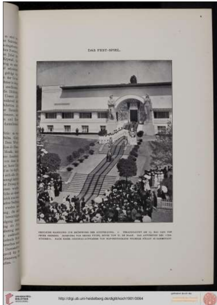
Figure 1: Opening of the Künstler-Kolonie, Darmstadt, 1901. The ceremony took place in front of the main atelier, which was designed by Joseph Maria Olbrich. From Koch and Fuchs (1901: 64). Original photo by W. Pöllot. Image courtesy of Heidelberg University Library. Licence: CC BY-SA 4.0, https://creativecommons.org/licenses/by-sa/4.0/ .

of his colleagues saw the theatre as a site of quasi-religious ceremonies in which the highest spiritual values of a community might be expressed, a view heavily influenced by Nietzsche and his followers (Anderson 1990). This vision was realised initially in Behrens's production of the Künstler-Kolonie's solemn opening ceremony in May 1901, involving a procession up the main staircase of the main hall, where robed figures witnessed a prophet's unveiling of a crystal endowed with transfigurative powers. Behrens subsequently elaborated proposals for theatre design involving radical departures from naturalistic theatrical convention in order to achieve a closer relationship between audience and performers (Anderson 1990: 121–124). Behrens himself, however, was able to put these ideas in practice only to a very limited extent in the staging of a Symbolist play at Hagen in 1909 (Anderson 1990: 127–130).