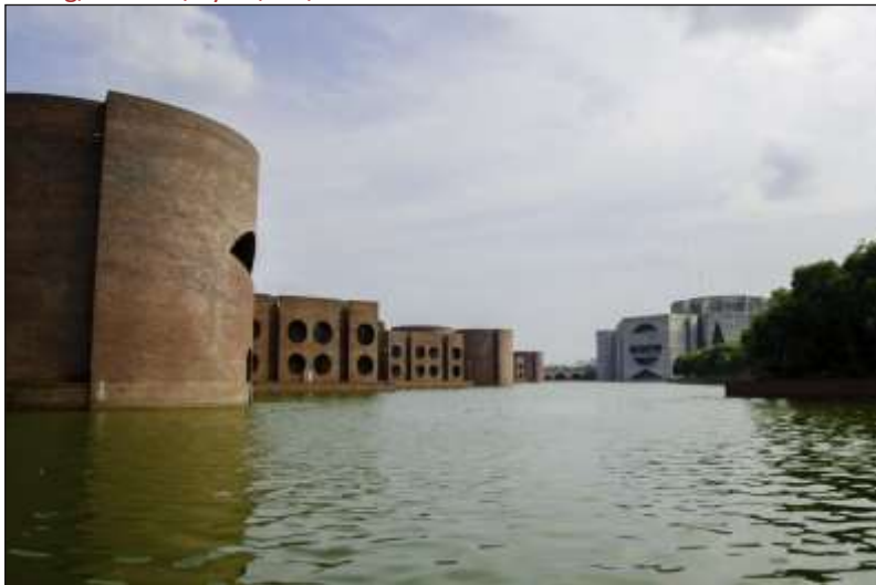
Figure 5: Louis Kahn, Jatiya Sangsad Bhaban (National Parliament House), Dhaka. Exterior view, with lakeside parliamentarians' facilities in brick buildings at left. Photo by Nahid Sultan and Saiful Aopu, 2014. Wikimedia, License: CC BY-SA 3.0, https://creativecommons.org/licenses/by-sa/3.0/deed.en .

This way of thinking entailed a willed forgetting of precedents, so that the architect might penetrate to the fundamentals: