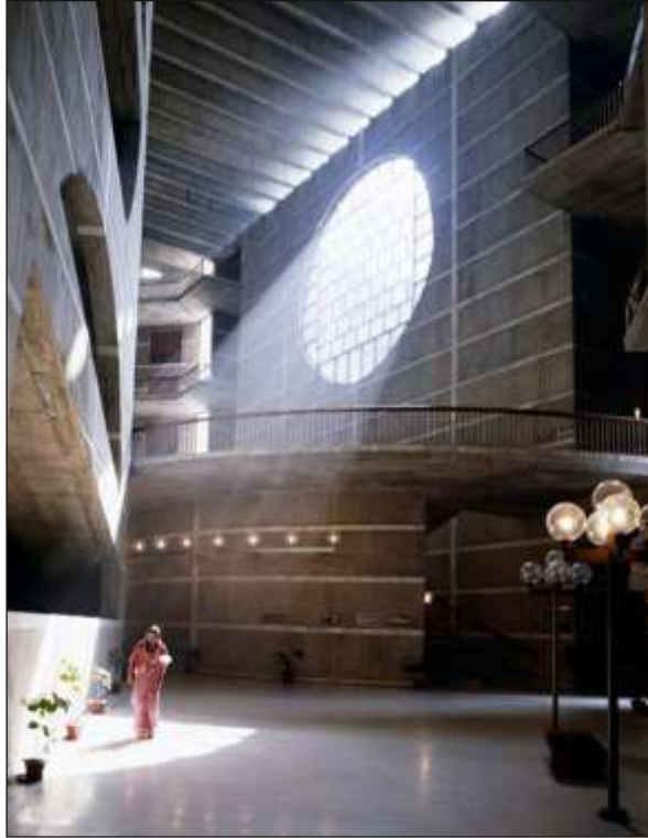
Figure 4: Louis Kahn, Jatiya Sangsad Bhaban (National Parliament House), Dhaka. Interior view. The building accommodates a complex inner community, with a scale and grandeur larger than its individual members. Photo by Rossi101, 2018. Wikimedia, License: CC BY-SA 3.0, https://creativecommons.org/licenses/by-sa/3.0/deed.en .