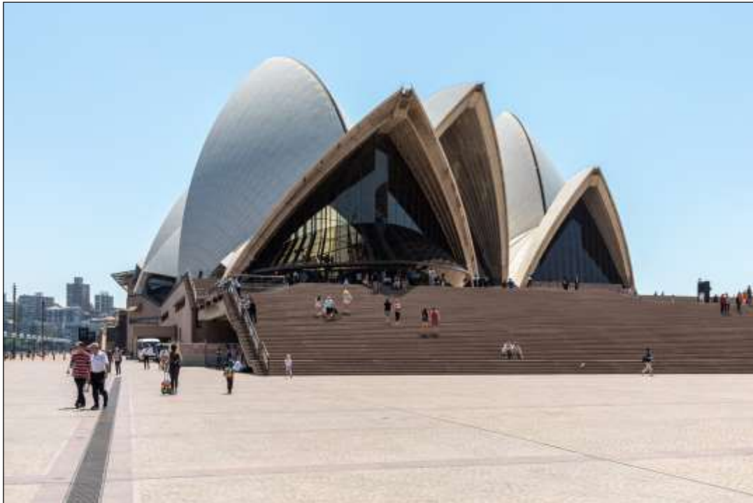
Figure 3: Sydney Opera House: view from southwest. The main halls are reached from the podium stairs, also by way of internal stairs from a porte-cochère directly underneath. Photo by Dietmar Rabich, 1962. Wikimedia Commons, Licence: CC BY-SA 4.0, https://creativecommons.org/licenses/by-sa/4.0/ .

The approach of the audience is easy and is distinctly pronounced as in Grecian theatres by uncomplicated staircase-constructions ... The audience is assembled from cars, trains and ferries and led like a festive procession into the respective halls thanks to the pure staircase solution. (Utzon 1957)